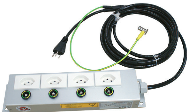
Hospital socket strip aluminium casing

The hospital plug sockets have been specially designed for acute hospitals with operating rooms and intensive care stations. In the operating rooms, various medical, electrical devices can be supplied via multi-way sockets. We offer two different casings to choose from, an aluminium and a hard rubber casing type 1400. These are fitted with T13 sockets and with ground connection sockets. A GIFAS hospital equipment cable is used as the power supply lead.