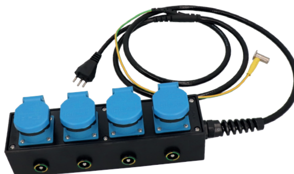
Hospital socket strip hard rubber casing