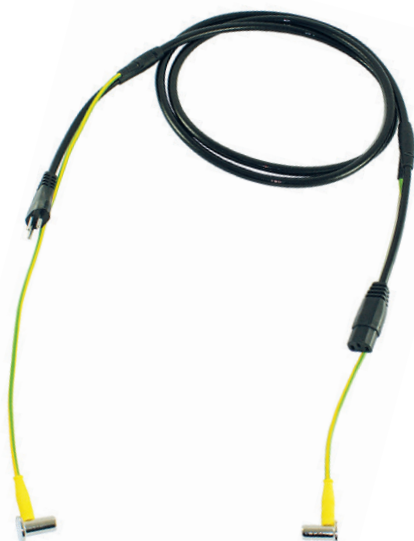
Hospital equipment cable with moulded plug connectors T12/T113.

for electrical installations in rooms used for medical purposes. (SN SEV 1'000-2'000, chapter 7.10)